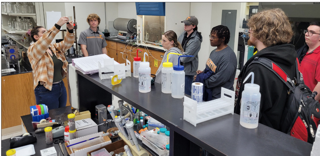
(Above photo) Shown is the contingent of UT Martin faculty and students who visited the UTSI on Nov. 20.