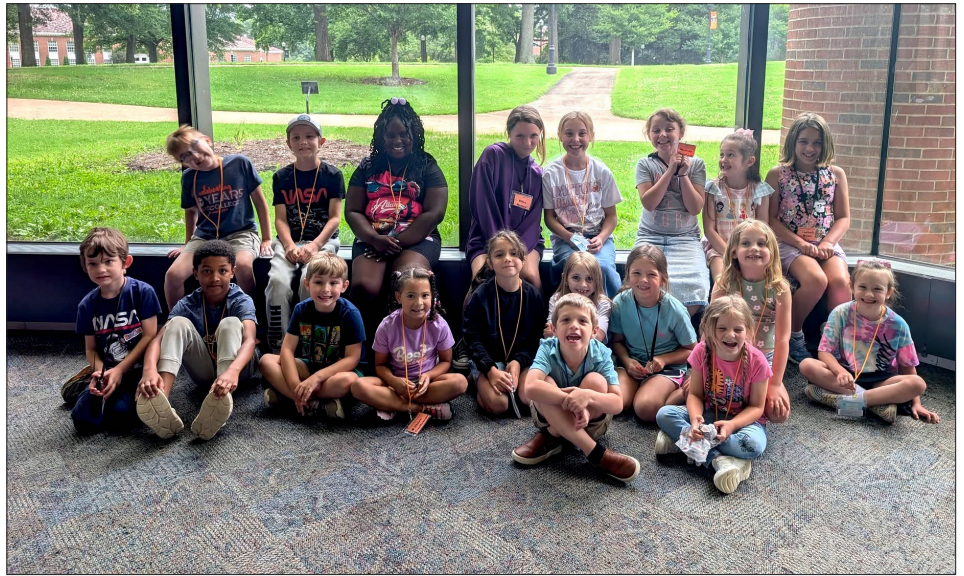
Nineteen students from kindergarten through fifth grade attended Camp Discovery: Library Edition, held June 16-19 at the Paul Meek Library and the Martin Public Library.

The second day gave them a full academic library experience at the Paul Meek Library on the UT Martin campus. Campers became "Data Diggers" in an information literacy session, learned how books are cataloged and processed, discovered how collections are built and shared through Interlibrary Loan and investigated the library to find