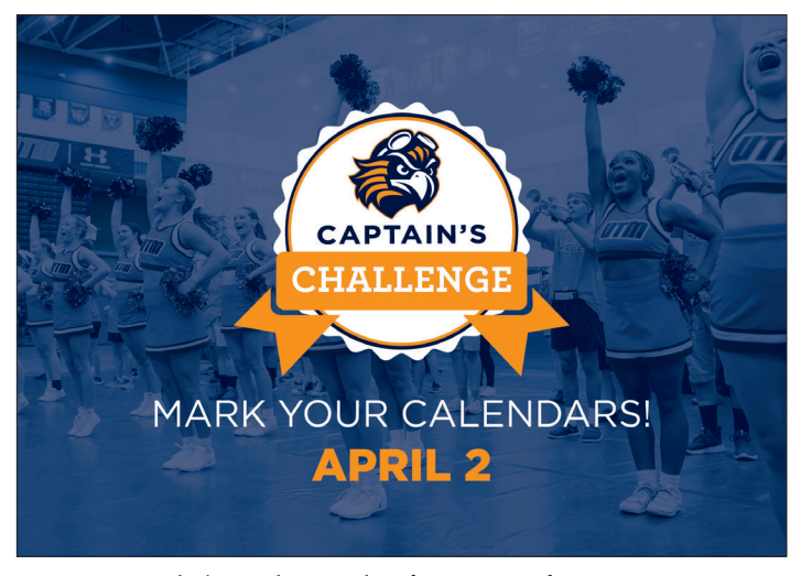
< Click on the graphic for more information! >

The library invites faculty, staff and students to explore these valuable collections and share their feedback.