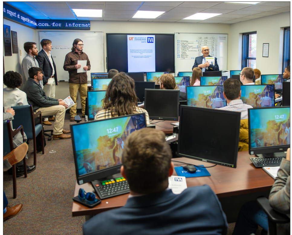
The AACSB International Board of Directors has confirmed that UT Martin will maintain AACSB accreditation for all business programs for the next six years. In this December 2024 file photo, participants in the UT Martin-TVA Investment Challenge Program gather to present the students' end-of-the-semester performance report in the Kelly Murray Investment Management Room in the university's Business Administration Building.

"Our college earned its initial accreditation in 1995, and as difficult as it is to earn the initial accreditation from AACSB, it is equally challenging to stay on the course, show evidence of continuous improvement, and earn reaffirmation of the accreditation,"