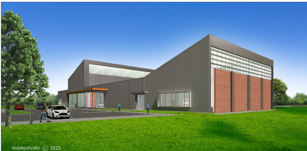
This artist rendering of the UT Martin TEST Hub shows the external view of the completed building. The facility is a joint effort by UT Martin, Tennessee Colleges of Applied Technology and Dyersburg State Community College to support and expand workforce and economic development in rural Northwest Tennessee.