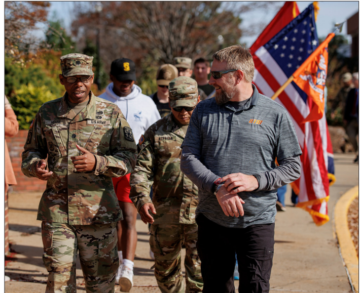
In this file photo, cadets, veterans and others are shown in the Veterans Walk held in 2022.

• Saturday, Nov. 9: Veterans Day Parade.