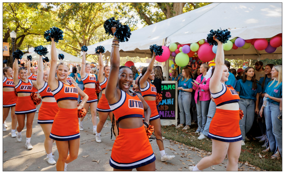
Marching Band prior to the game. A longstanding tradition, the Quad Walk will take place at 11 a.m. Oct. 5.

The event is sponsored by the UTM Latin Hispanic Student Association and the Office of Multicultural Affairs.