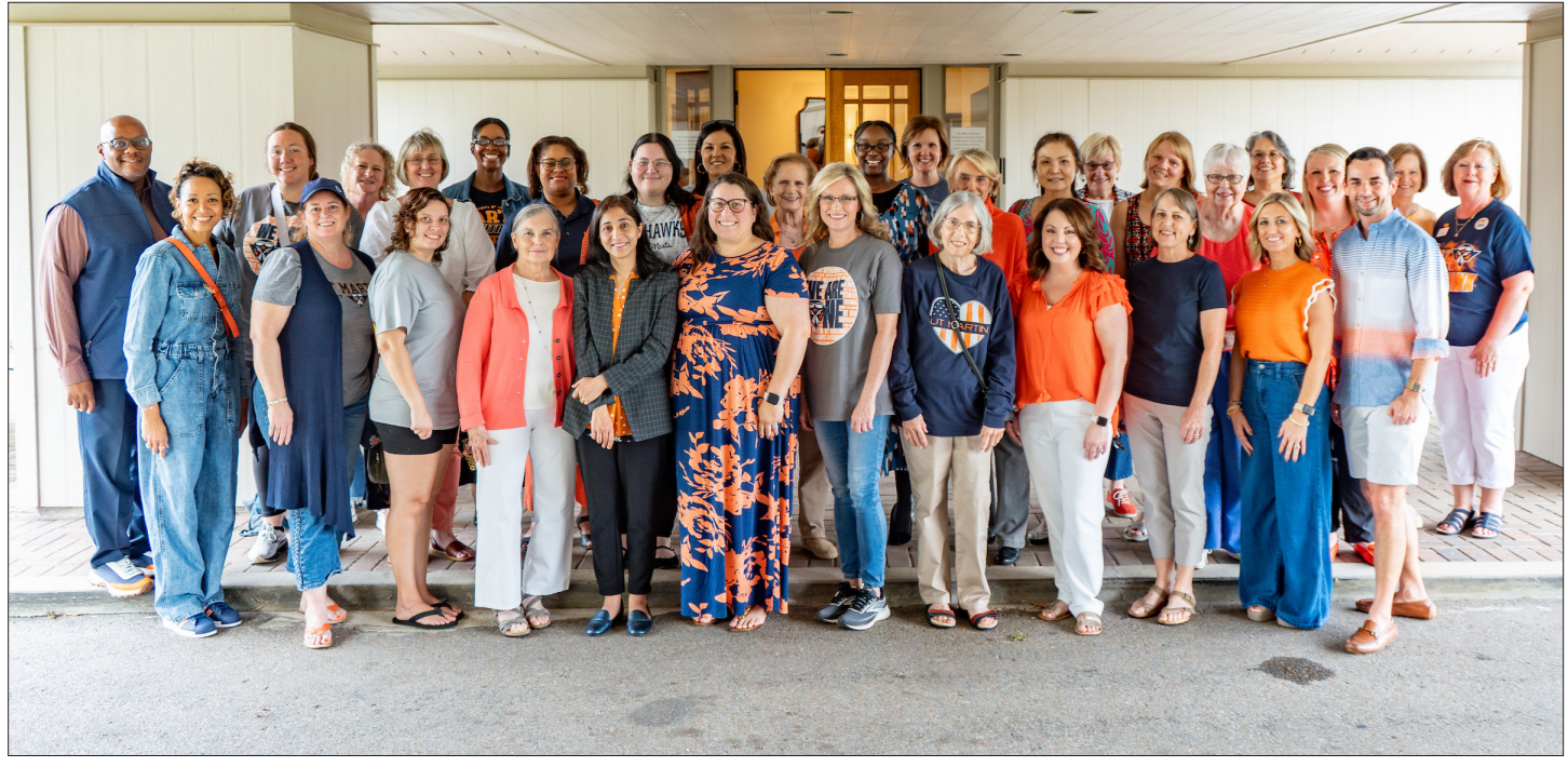
The Faculty Women's Club hosted a welcome reception for all new women faculty and staff and the wives of faculty and staff. The event offered an opportunity to meet new colleagues. The reception was held Sept. 21 in the Dunagan Alumni Center. Those who attended the reception received two complimentary tickets to the UT Martin-Missouri State football game that followed the reception.