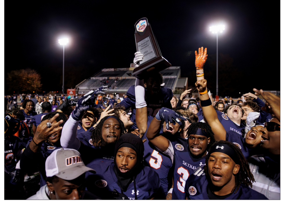
The UT Martin Skyhawks have won at least a share of the last three conference titles. Help cheer them on to a fourth straight title by purchasing a season ticket!

have purchased their season tickets online, the ticket office will be able to assign those ticket holders to their previous seating.