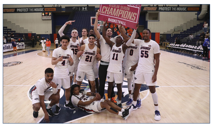
The Skyhawk men's team celebrated the OVC regular-season cochampionship Saturday, claiming the No. 2 seed in the OVC tournament.

The UT Martin men's and women's basketball teams qualified for the Ohio Valley Conference tournament at the Ford Center in Evansville, Indiana.