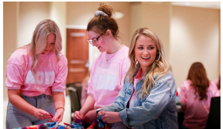
Students in the Alpha Omicron Pi sorority volunteer for a service night during Greek Fest 2022.

Line dance will be held at 7 p.m., March 9, and the Step Show will be held at 7 p.m., March 10, both in the Skyhawk