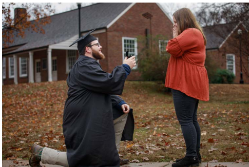
photo highlights from UT Martin's fall commencement ceremonies