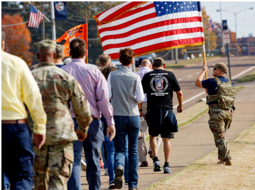
HONORING VETERANS – Participants in the 2021 UT Martin veterans walk are pictured. This year's walk is set for 1-2 p.m., Thursday, Nov. 10. The public is invited to participate.