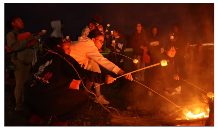
People enjoy roasting marshmallows at Pacer Pond prior to the fireworks show Sunday evening.

Events for this year's Homecoming at UT Martin have already begun, but there are many, many others to come.