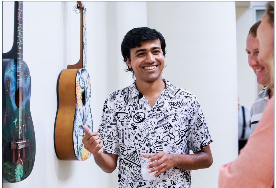
The "Guitar as Art" show is a popular attraction during the Tennessee Soybean Festival. This year's exhibit will take place at 2 p.m. on Sunday, Sept. 3, at the Fine Arts Building.

UT Martin's Flight Crew will give away 1,000 free tickets to the Brothers Osborne concert by attending the free ticket giveaway at 11 a.m. Tuesday, Aug. 29, on the Boling