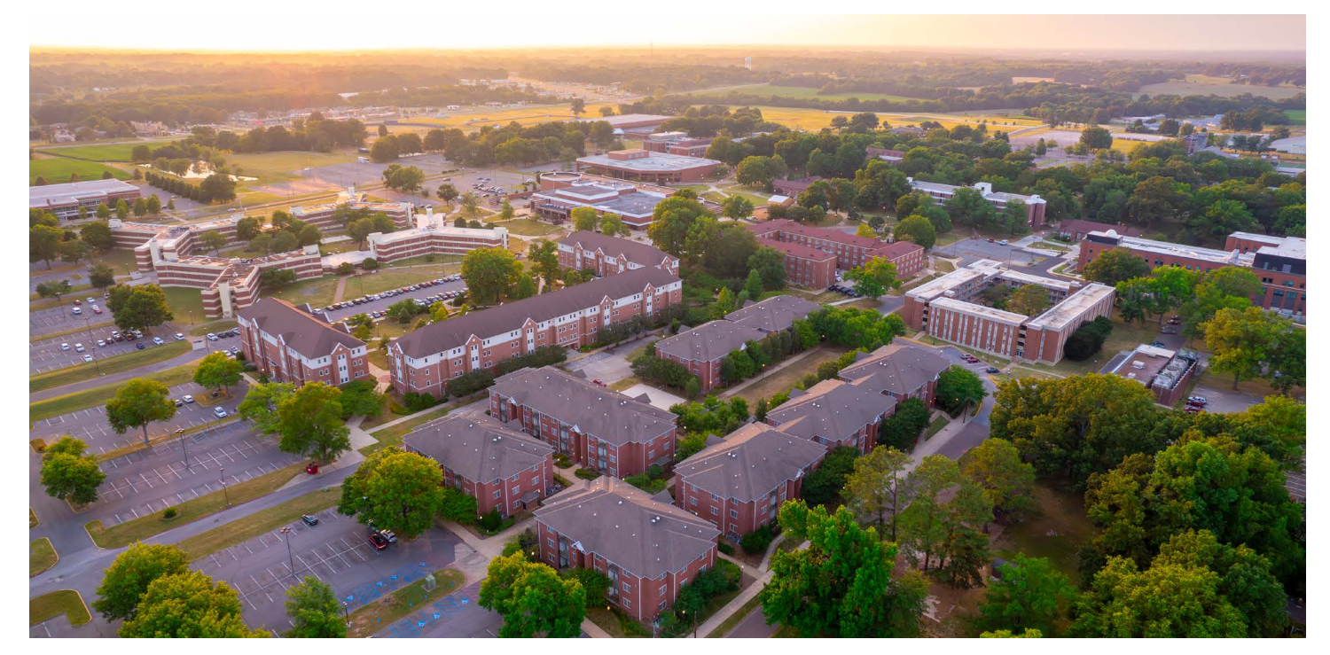
SUMMER SUNSET – The sun sets over the UT Martin campus last week. Summer on the UTM campus brings several summer camps and loads of activities, including Summer Orientation and Registration. SOAR is a one-day orientation experience that is designed to introduce incoming students to UTM and ease their transition into college life. The next SOAR session is this Friday, June 23.